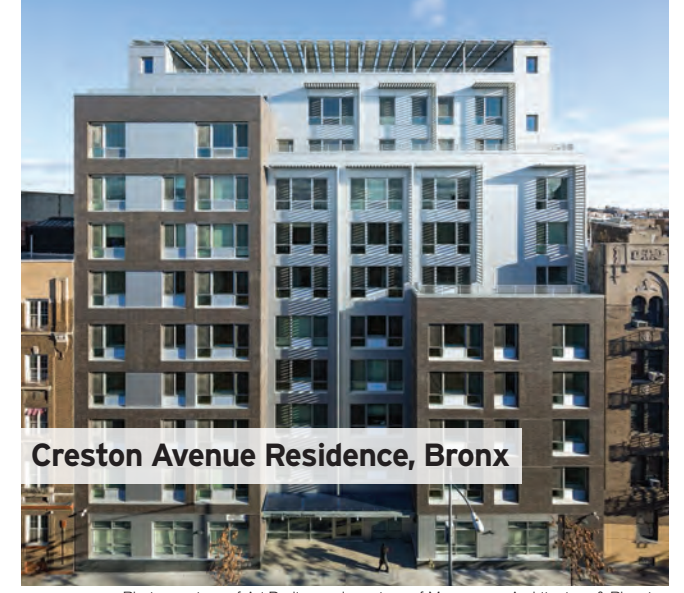
Photo courtesy of Ari Burling and courtesy of Magnusson Architecture & Planning