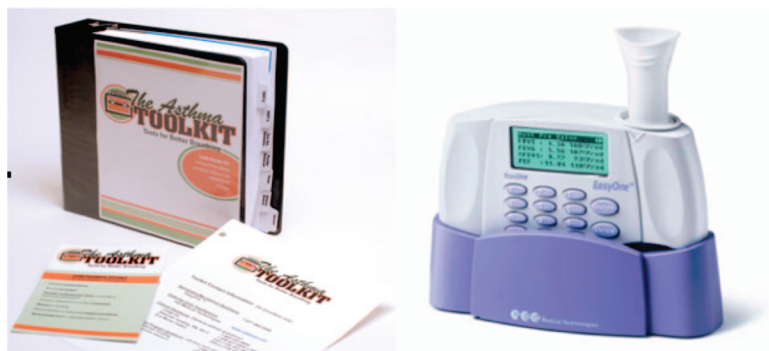
Figure 1. Clinician tools, including training manual and spirometer.

During the first visit of the Colorado Asthma Toolkit Program, which lasted a full day, training content included (1) a brief overview of the pathogenesis and treatment of asthma, (2) categorization of severity and control, (3) guidelines for prescribing rescue and controller medications, (4) trigger avoidance, (5) guidelines for referral to a specialist, (6) keys to communicating effectively with patients to improve adherence, and (7) case studies. The coach supervised all staff in hands-on practice with spirometry. Coaching also focused on practical ways to incorporate and systematize the use of