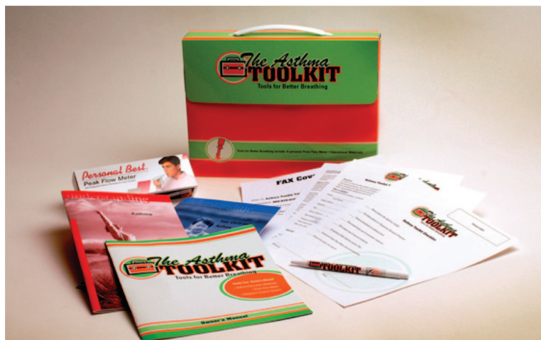
Figure 2. Patient tools including peak flow meter, educational materials, and Toolkit box.

An educational, telephone-based interactive voice response (IVR) program was developed to provide supplemental education and to encourage patient and parent adherence to treatment. IVR uses technology that can place telephone calls to patients and interact by asking the patient to respond on their keypad. It is particularly well-suited to communicate with families located in rural areas because most can be reached by telephone at relatively small cost. Messages, information, and advice to patients were tailored according to the patients' responses and produced in both English and Span-